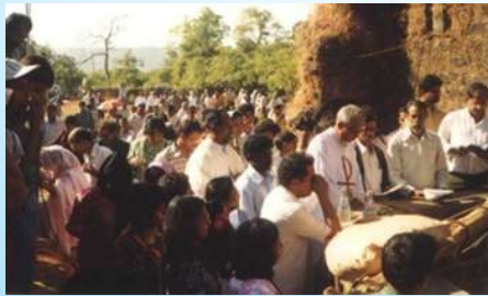
The Well adjoining the church with miraculous healing water being blessed.